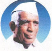
Founder President, Council of Education, Kolhapur